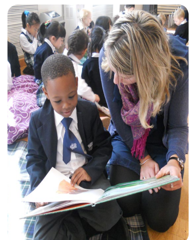
Key Stage 1 enjoying their reading with hot chocolate