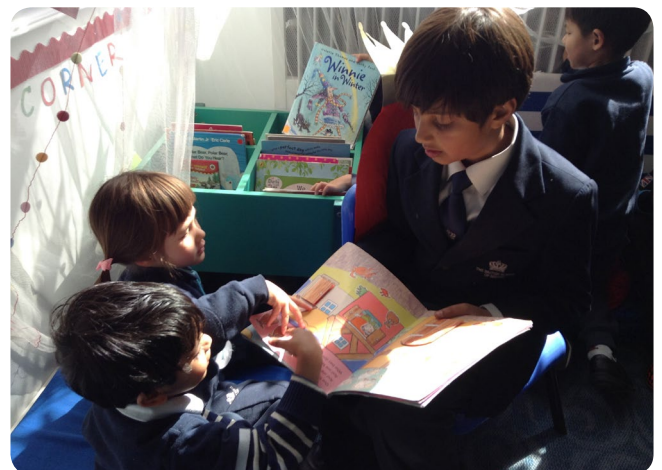
Year 6 reading stories with Nursery