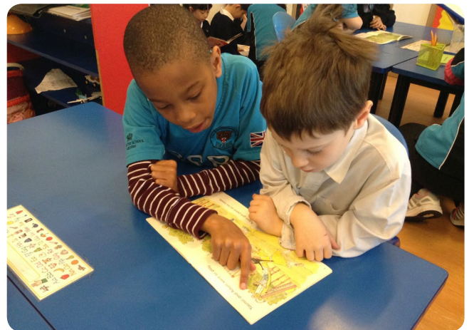
Year 1 and Year 3 visited each other for buddy reading