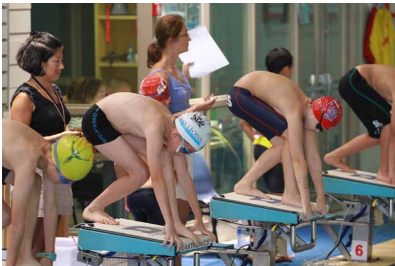
On Saturday, sixty five BISS Lions swimmers went to SCIS to compete against the rest of the Shanghai Swim League in their first competitive race of the season.