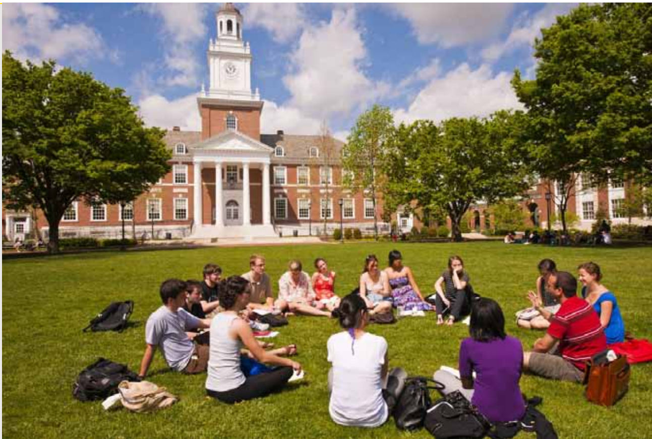
Students enjoy campus life on the front lawn of Johns Hopkins University, a world-class university in Baltimore, Maryland, offering undergraduate and graduate degrees.