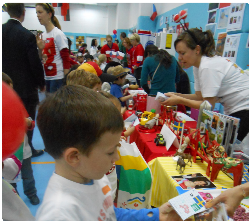
International Day - an excellent example of how parent support makes a difference

We spend a lot of time thanking the pupils within our school for their collaboration with us, as they travel on their learning journey. I'd like to take this opportunity to thank all the parents for their support, involvement and enthusiasm for the learning in our school too. The best learning takes place when it spills over into home and vice versa; so to everyone involved, we thank you.