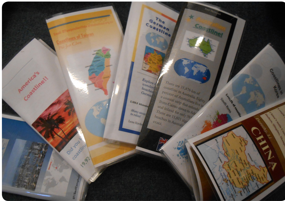
Year 5 learning about coastlines

The children in Year 5 have been studying coastlines in Topic this term. After looking at the structure and features of coastlines around the world, they found out the lengths of the countries in the world with the longest coastlines and compared this with data about the area of land and the population of the country to see if there was any relationship. They then found out details of their home country coastline and created a tourist brochure outlining the key uses of the coastline.