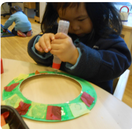
Early Pattern Work (Seashells)