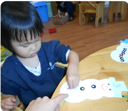
Snowman Button Counting (Starfish)

The children have looked carefully at circular shapes and practiced making snowmen with play dough, counting the number of buttons. We noticed how many sides a triangle and square have and matched them onto the correct shape holder. It was great fun painting triangular reindeer faces and sticking on a shiny red circular nose.