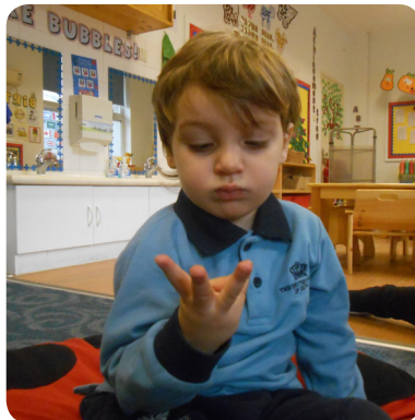
Counting on Fingers (Tadpoles)