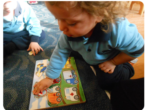
Jigsaw Fitting (Tadpoles)