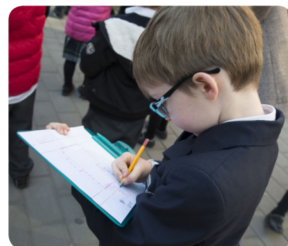
Mapping our way to the bakery