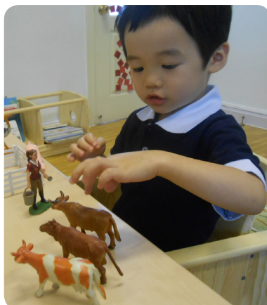
Counting the Animals (Seashells)