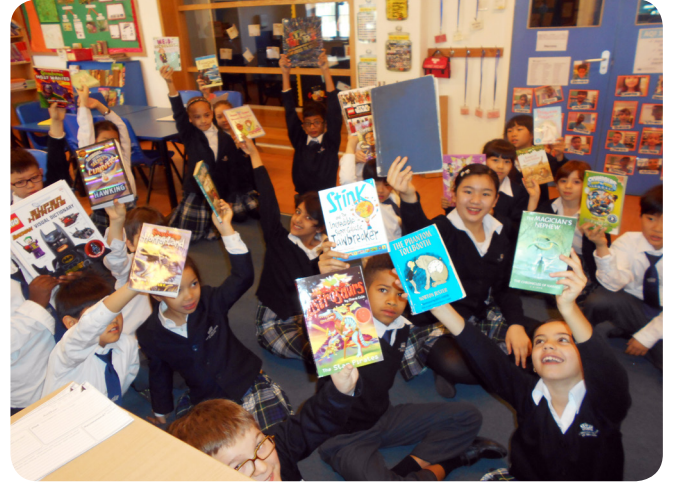
Year 4 Book Review & Reading with Nursery