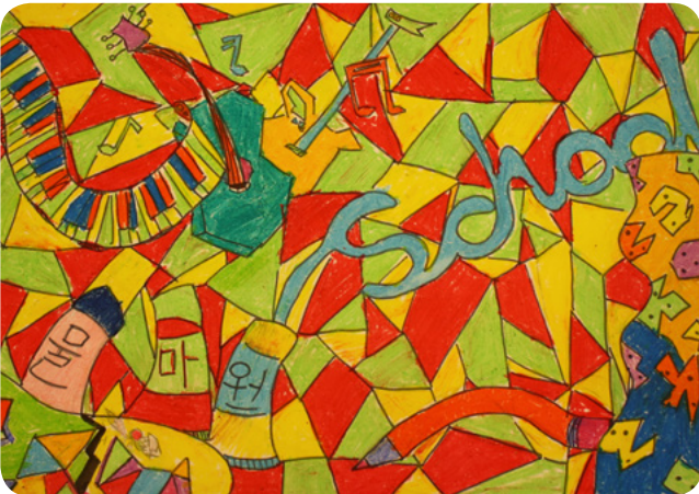
Chloe Huang, Year 5 Flamingos

As well as seeing these works on display in school, you can grab your copy of this month's Beijing Kids to see more of the amazing abstract art for yourself.