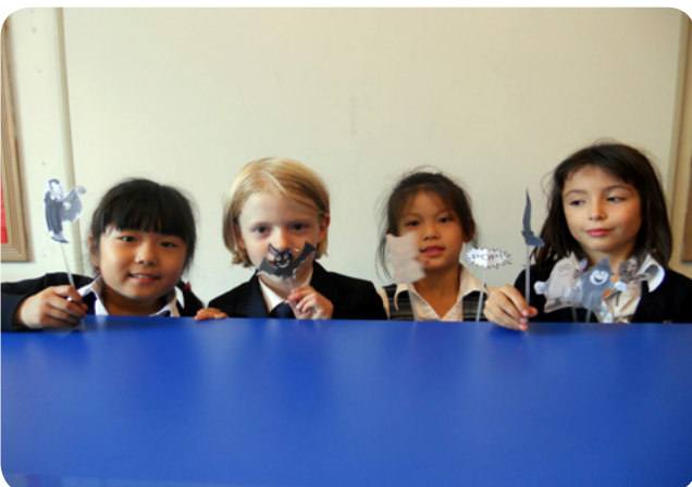
The voice-actors of Year 3 showing their puppets.