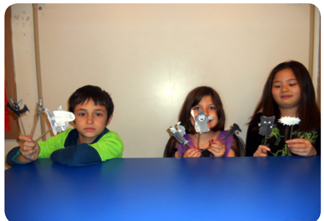
The voice-actors of Year 5 showing their puppets.