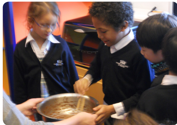
Year 2 students enjoying the start of their chocolate topic

We ended the week making our own chocolate crispy cakes. While doing this we videoed and photographed the different parts of the process. Next week we will put all of this information and practice together for the children to write their own set of instructions.