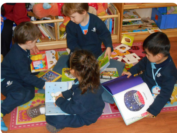
Our Pre-Nursery children exploring the books we have at school