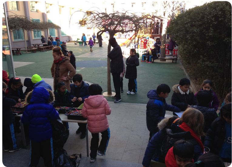
Year 4 sorting resources on the playground

During Tuesday break time the children were forced to work at stations outside, sorting class resources, sharpening pencils and cleaning whiteboards. Unfortunately, the children were being unfairly treated by their Year 4 teachers who did not give them training on how to carry out any of these activities but also did not provide appropriate tools in order for them to complete the task in the cold, uncomfortable working conditions. On returning to class the children shared their ideas and reactions to the activity. The children had varied reactions, although they were mostly negative; "It's not fair, we are children not slaves!", "We were made to work in a crowded, uncomfortable and unhealthy atmosphere." "There were so many jobs and we didn't know how to do them." "It was a horrible working environment – much too cold." "We did not have the tools we needed to do our jobs properly."