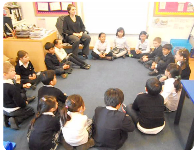
Year 4 discussing equality and discrimination

On Wednesday the children were unexpectedly split into two groups which both worked on different activities. While a minority group were copying out definitions silently from the dictionary, the rest of the children were given free choice of games and activities to take part in. Group one were given little attention whilst group two were praised and rewarded with house points and sweets. At first the group receiving preferential treatment didn't seem to pay much attention to the others but as some of the minority group began to get frustrated and upset with their situation a few children chose to opt out of a game to help the others. It was interesting to see the children's reactions to this unfair treatment, which instigated a very poignant discussion on equality and discrimination.