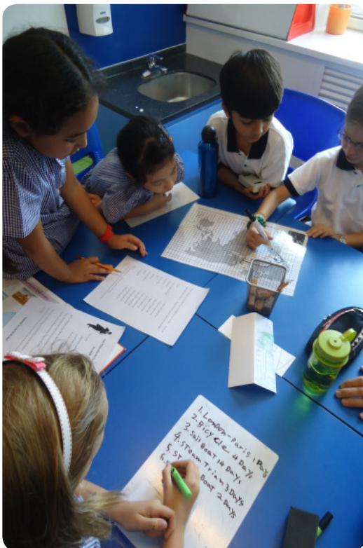
Year 4 students working together as a team

We will continue to encourage the children to become independent learners and build upon and strengthen their High Performance Learning skills to enable them to be the best that they can be.