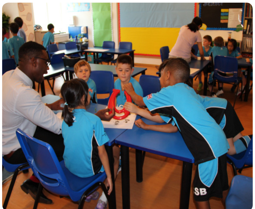
Year 3 Toucans talking about the properties of magnets

The KS2 team are well prepared for a busy and exciting term. We aim to inspire the children through our integrated curriculum. Across KS2 during the Autumn term, the children will be travelling the world, going back to Ancient Egypt, exploring the coast lines and taking a roller coaster ride through fairgrounds.