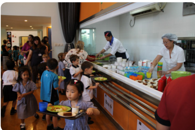
Year 1 students getting their lunch