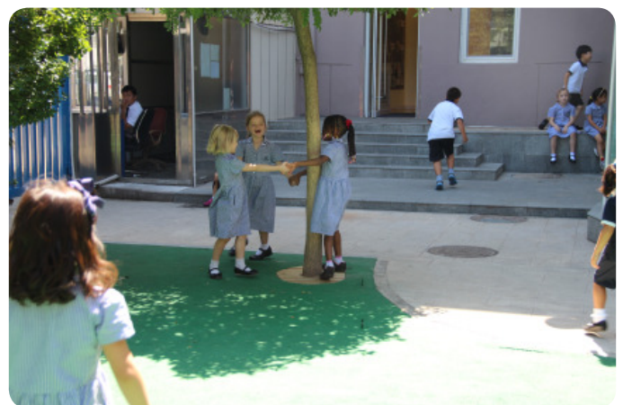
Year 2 girls playing together at breaktime

I am particularly excited to begin next week, because in Year 2 we shall begin our first topic 'From A-B' which focuses on transport and journeys. Year 1 will be looking further into their topic 'Marvelous Me' and I look forward to learning more about all the children in KS1.