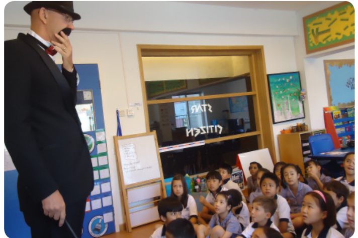
Phileas Fogg pays a visit to the Year 4 students

It was fantastic to see both the children and staff arrive at school on Monday looking refreshed and talking excitedly about the term ahead. The children seem to have settled quickly into their new classes and the KS2 team have commented on the positive attitudes and enthusiasm shown in their classrooms this week. I look forward to the children continuing with this impressive start!