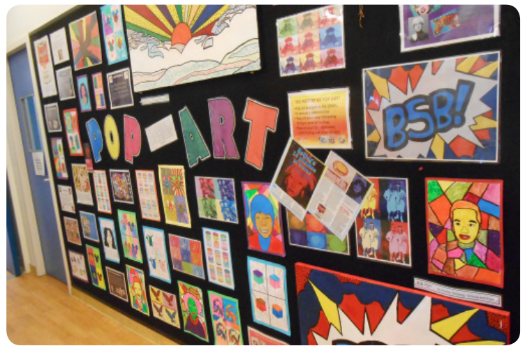
Enjoying the Pop Art theme in Year 6

Some subjects are still taught discreetly most of the time eg maths and science, but where possible we tie it all in together. Our specialist teachers have been working hard to link the topic to their specialist subject area too. This approach to teaching and learning enables the children to become absorbed in learning and provides the hook needed to engage. Ask your child if they know what theme or topic they are doing this term. If they don't know yet, it will be a matter of days until they are certain of what their theme is in class!