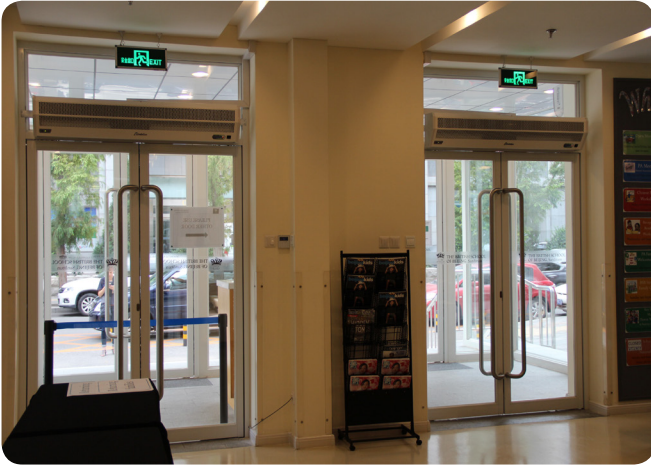
The air curtains which have been installed above external doors

New Air Purification System - We have had a new air purification system installed throughout both campuses which will help us to further improve the quality of the indoor air for our students, particularly in times of high pollution. This includes air curtains on the main external doors and ceiling mounted purifiers in all classrooms and shared areas.