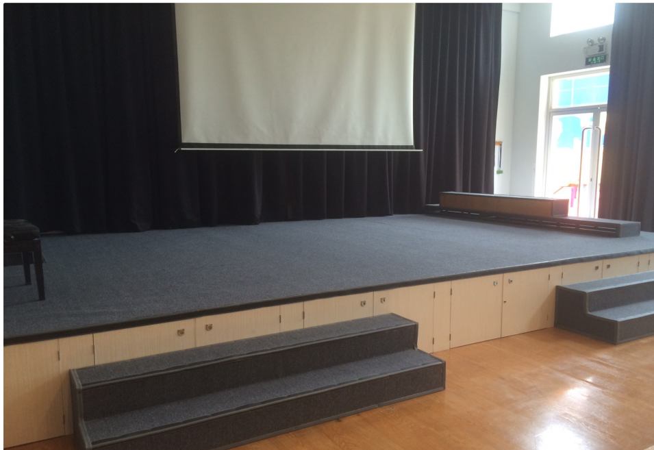
Our new stage

A New Stage - We have replaced our stage in the Primary Campus Hall and installed a new projector, which is just waiting for a whole host of productions and performances to take place on it during the year.