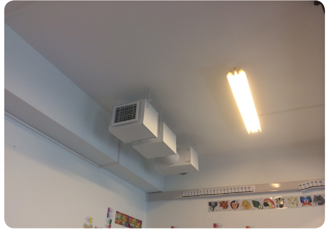
The air purification units which have been installed in each classroom

A New Stage - We have replaced our stage in the Primary Campus Hall and installed a new projector, which is just waiting for a whole host of productions and performances to take place on it during the year.