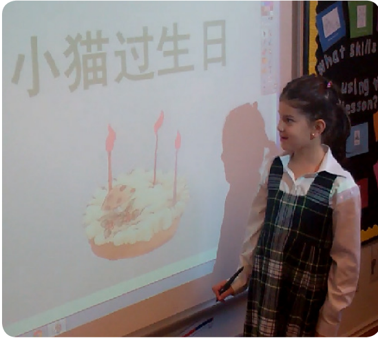
Year 2 learning about birthdays

In Sanlitun Chinese classrooms all groups of students have experienced a dynamic week.