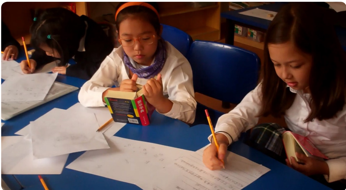
Year 4 students designing shoes!

In Y5&6 Chang Cheng class, children learnt the topic of places around us. Children practised how to give directions in Chinese. They also played tour guide in the classroom to practise all the words they had learnt this week.