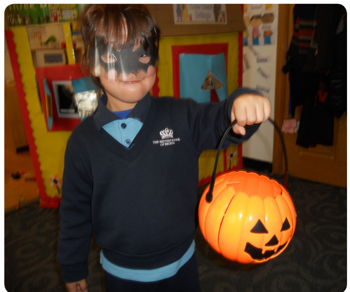
What's inside the p-p-p-pumpkin?