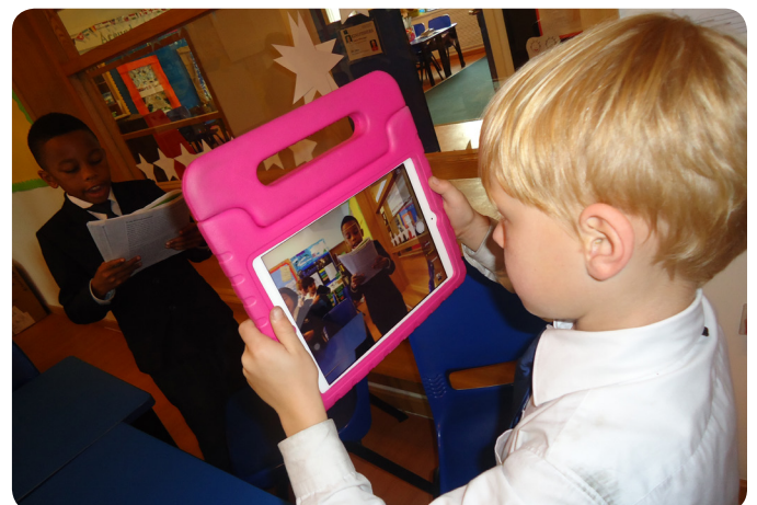
Year 3 students busy preparing their news reports