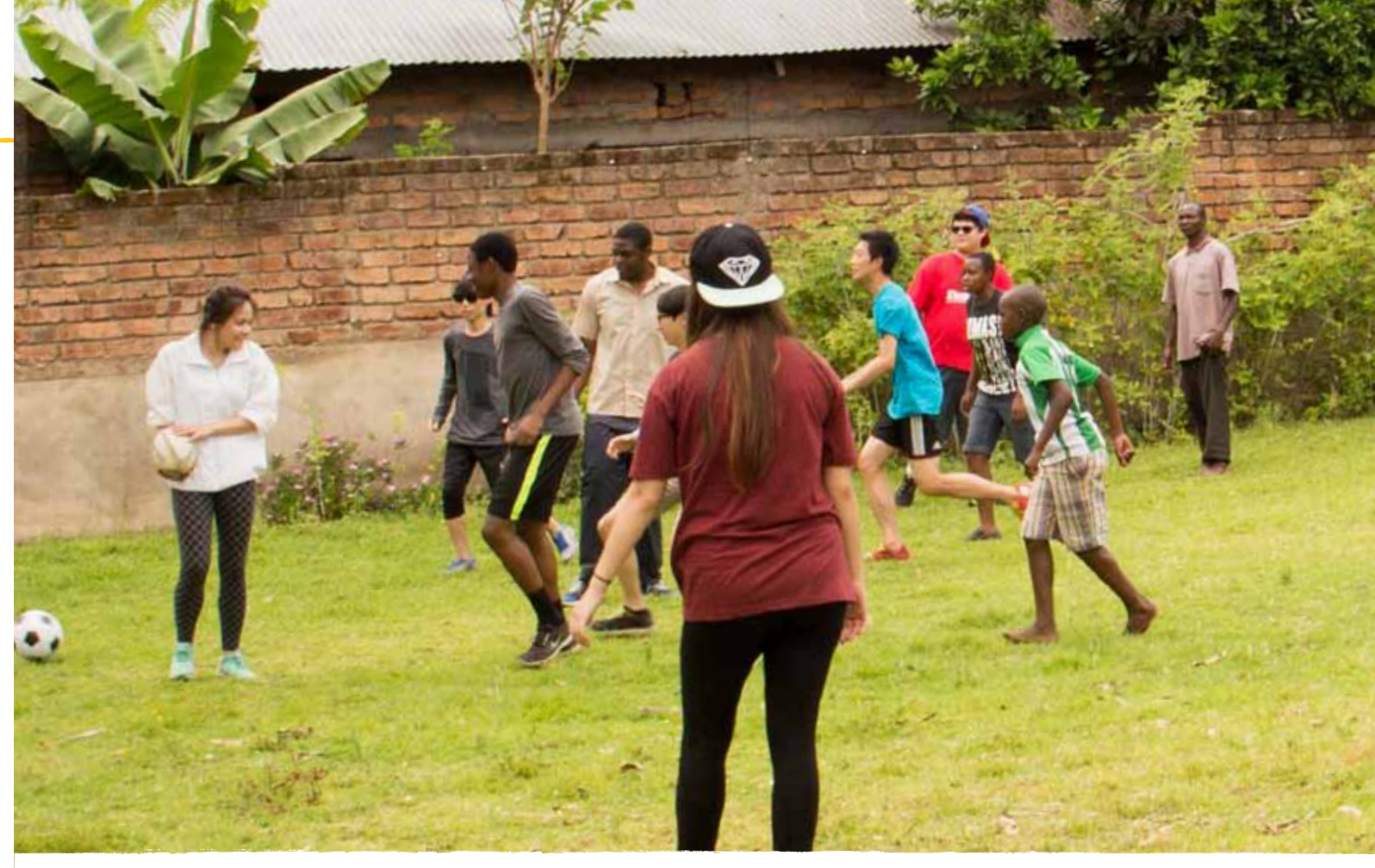
Students from The British School of Beijing, Shunyi, at the Seeway Tanzania Children's Centre