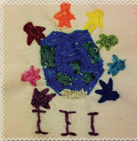
British International School of Boston

Can you see what features they think represent their school community?