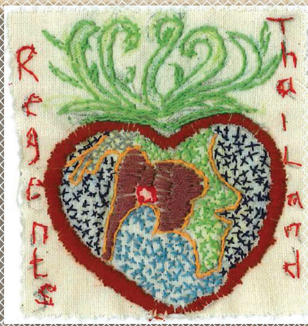
Regents International School Pattaya